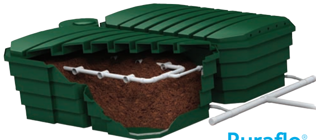
Puraflo® Peat Fiber Biofilter for Clean Water