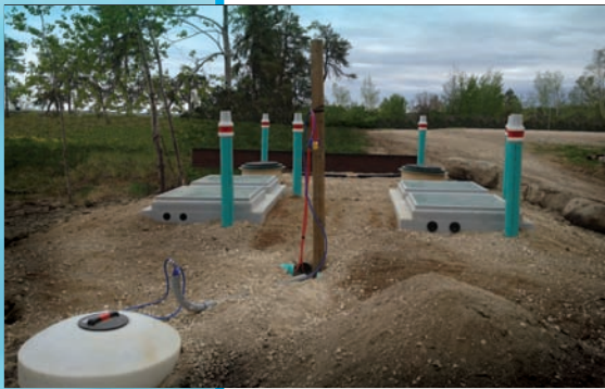
After installation of the two Platins

By allowing less nitrogen and fewer pathogens to enter the environment, Anua's Platinum and Puraflo solution better protects the area's fishing and wildlife.